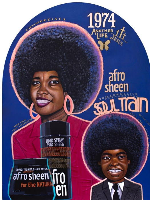
William Scott, Untitled , acrylic on canvas, 2019.

This year's fair will feature two curated presentations: a celebration of Creative Growth Art Center's 50th anniversary, and an exhibition of artworks by the Beat Generation poets